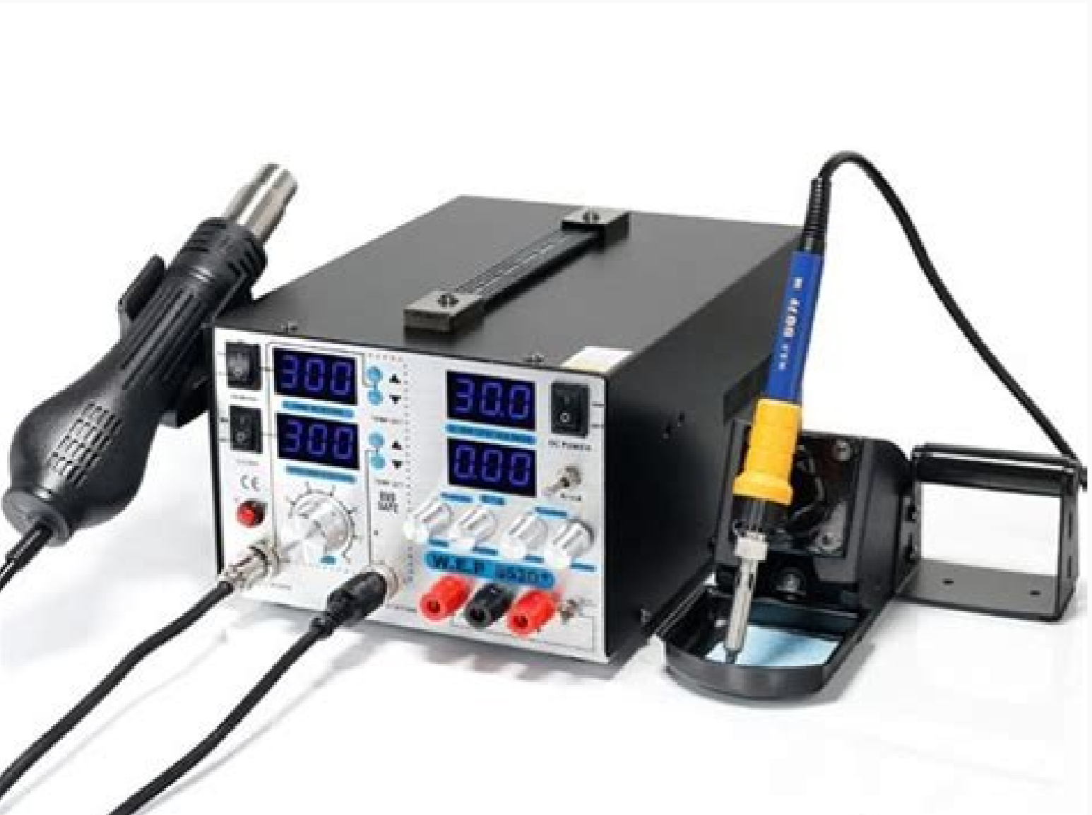
Achi ir6000 bga rework station manual.